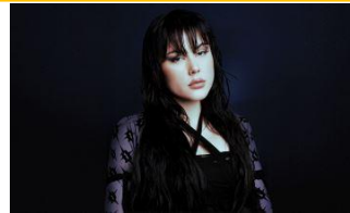
Serbia TEYA DORA - RAMONDA